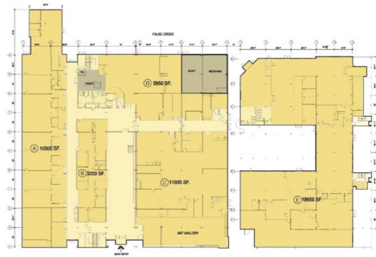
Arts + Innovation Hub Floor Plan – Second Floor